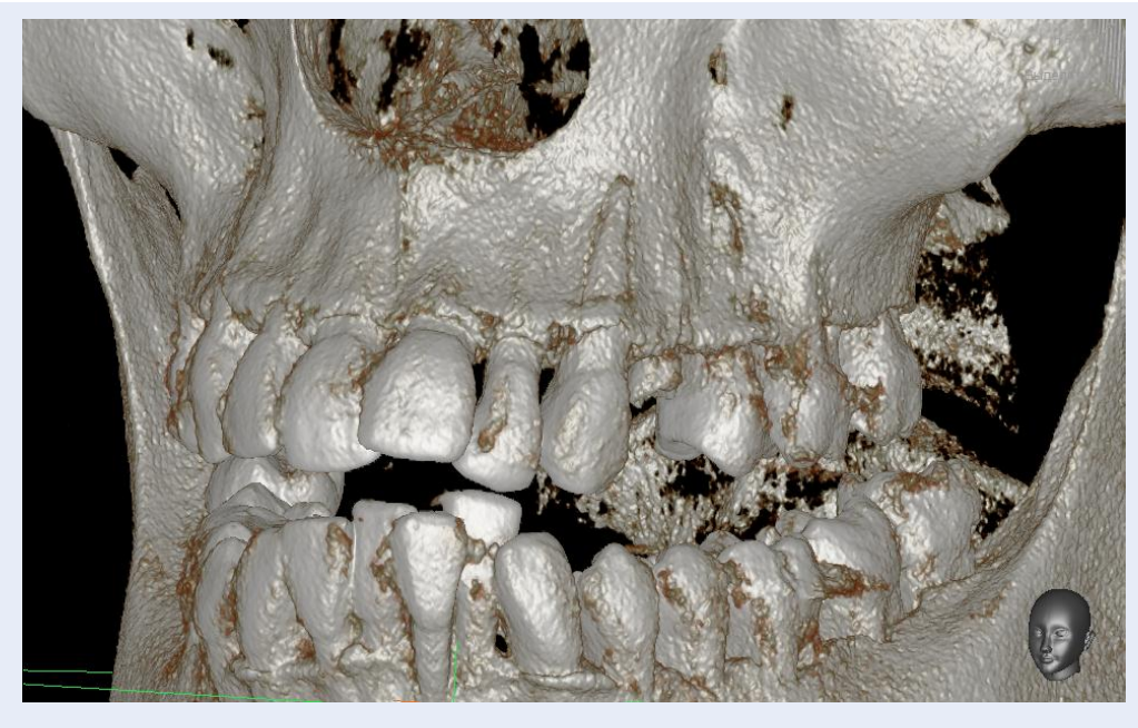
Figure 2: CBCT visualization . The fenestra of the vestibular cortical plate is marked in red.