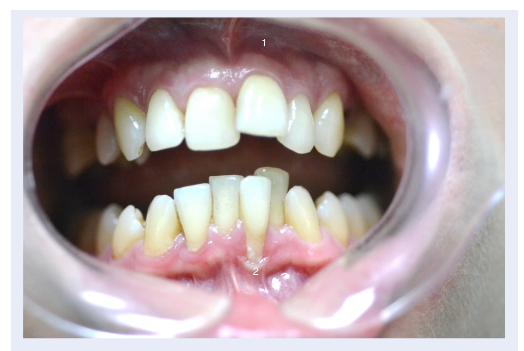
Figure 1: Picture of the dentition and areas of the oral mucosa. 1 – telangiectasia; 2 – McCall's feston.